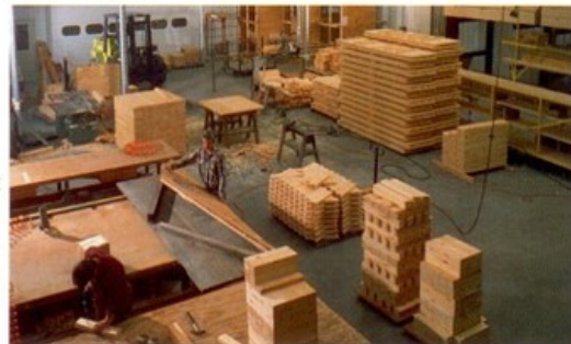
Our manufacturing facility is modern, efficient and climate controlled.